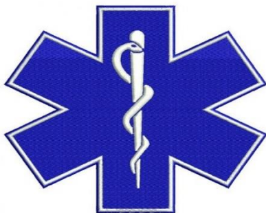
Star of Life Sign